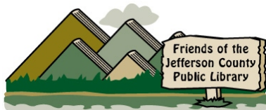
"From the Plains to the Peaks of Jefferson County"

The Friends Gift and Book Shop is located in the Belmar Library and is open from 11 a.m. to 5 p.m. Mondays through Thursdays, and 10 a.m. to 4 p.m. on Fridays and Saturdays. For more information call (303) 275-2216.